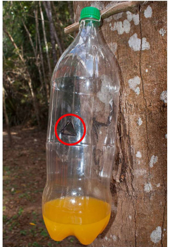
Fig 3. View of attractive trap in two-liter PET bottle, containing 200 ml of passion fruit juice and installed 1,5m above the ground on tree trunk. Inside the red circle the triangle-shaped of 2x2x2cm can be seen.

The attractive traps must be produced using two liters PET bottles, with three triangle-shaped openings on the side (2 X 2 X 2 cm) on the middle section (approximately 15 cm from the bottom) (Fig 3).