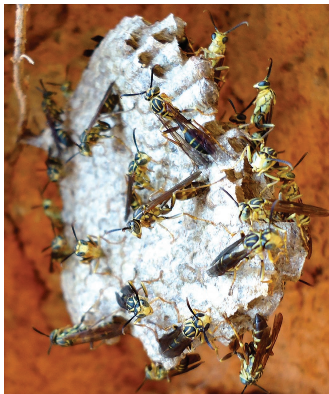
Figure 2. Nests of the wasp Mischocyttarus consimilis Zikán in the municipality of São Gonçalo do Sapucaí, Minas Gerais.